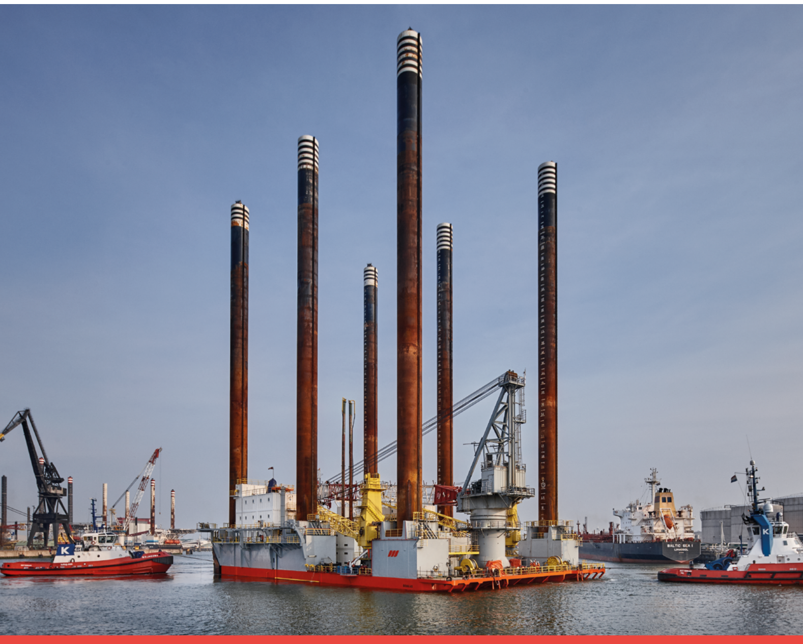
MAIN CRANE CAPACITY 300 t | ACCOMMODATION 153 POB | MAX WATER DEPTH 45 m | DECK SPACE 900 m<sup>2</sup>

Seafox 4 is a six-legged, self-elevating jack-up unit for accommodation, construction, maintenance, and well services. The unit was built to American Bureau of Shipping (ABS) classification requirements and is designed to operate throughout the year in water depths of up to 45 meters. The unit offers permanent accommodation for 153 Persons on Board (POB) and has an accepted UK Safety Case for accommodation, maintenance, and well-service activities in the Dutch and UK sectors. Life on board is pleasant and positive thanks to the unit's leisure facilities and health and well-being amenities.